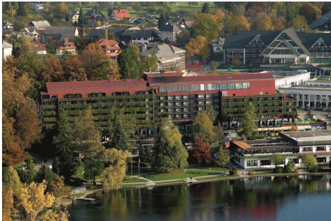
Hotel Park, Bled

Hotel Park - Sava Hotels & Resorts Cesta svobode 15, SI – 4260 Bled, Slovenia